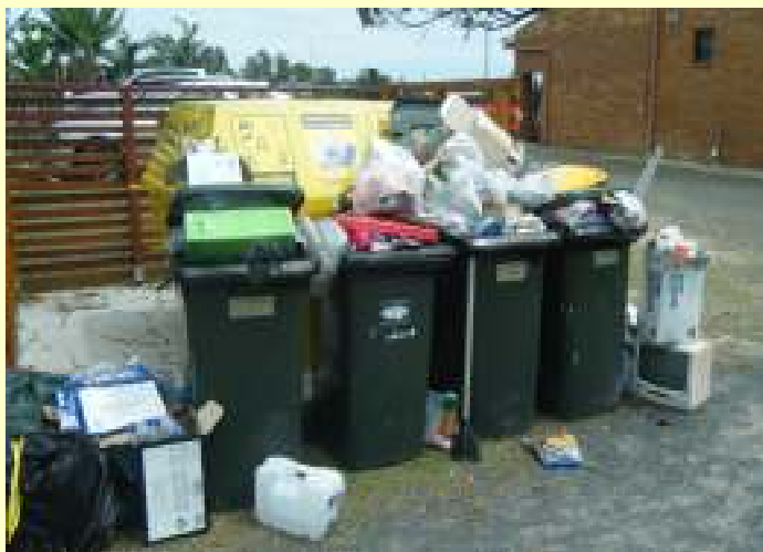
The volume of waste at peak periods can exceed capacity