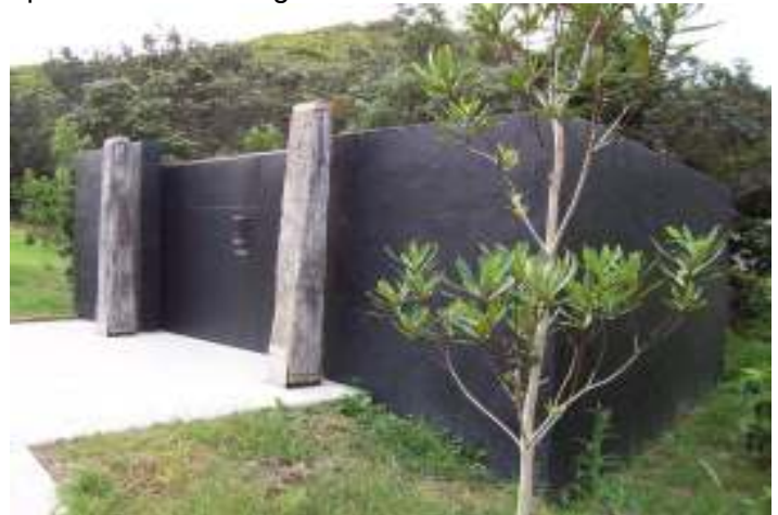
The waste station constructed at Linnaeus blends effectively with the natural environment

Initiatives to introduce more effective waste management began in 2007. The estates waste stream fluctuates depending on the number of people in residence, so waste management decisions needed to accommodate these changes. In June 2007, the staff at Linnaeus began investigating options to separate cardboard, paper and commingled recycling from mixed waste. Bins size, accessibility, signage and cleaning options were investigated.