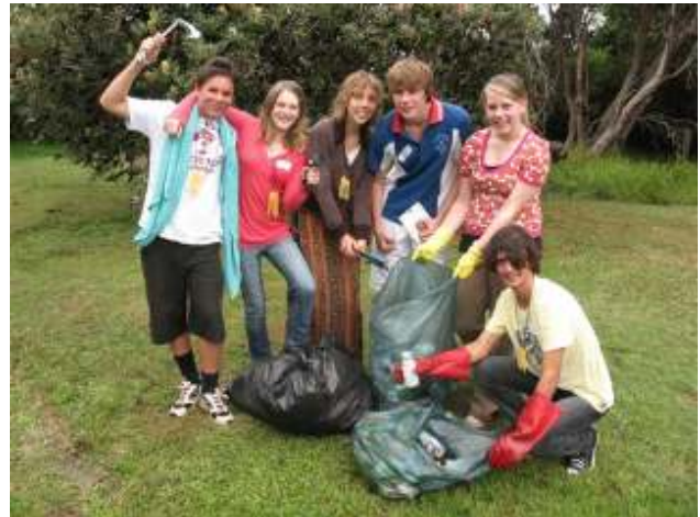
Students are trained in waste auditing to help their own schools develop waste action plans

The focus of the Students Using Sustainable Strategies (SUSS) Forum is sustainability and the main aim is to build the capacity of Year 7 to 10 students and accompanying teachers to undertake and implement sustainable conservation strategies within their schools and community. The Linnaeus Estate is represented on the SUSS Steering Committee and as such have a significant input to the organisation of the SUSS Forum. This Forum for regional high school students will be held at the Estate for the second year, in May 2008.