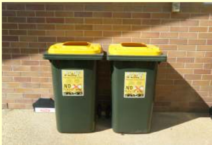
The new recycling bins ready for use at the canteen