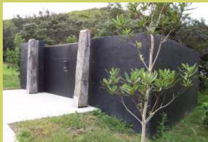
The waste station constructed at Linnaeus blends effectively with the natural environment

Over the past year the Linnaeus Estate at Broken Head near Byron Bay has undergone significant change to their waste management practices. Initially, a waste station was constructed to house the new system.