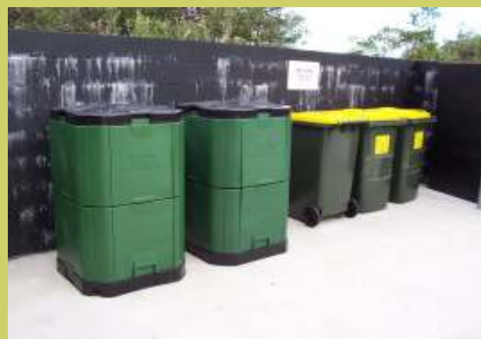
Organic and recycling bins inside the station

Signage was attached to bins to raise awareness and promote the correct separation of recycling and waste.