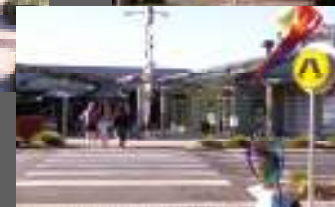
Lennox has a wide variety of small businesses

Engaging an entire CBD can be daunting but also offers opportunities for the sharing of services and co-operation between businesses.